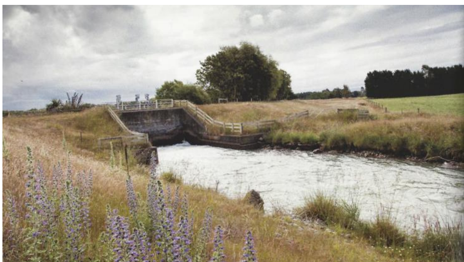
Bells Pond control gates